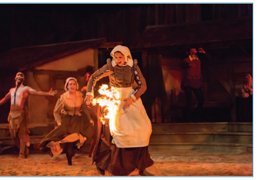
Allen's rig was designed to easily create a variety of time-of-day looks, including this nighttime battle scene.

a fixture had to possess a feature set allowing for smooth dimming, without stepping, flicker, or pulse. It also needed to fade to and from black without popping on or off at the low end of the dimming curve. Output had to be punchy, colors had to look really great, and light had to be delivered without chromatic aberration, blending seamlessly with tungsten and other LED sources. Perhaps most important, it had to be completely sealed from the elements. This dictated fixtures with an IP65 rating or better.