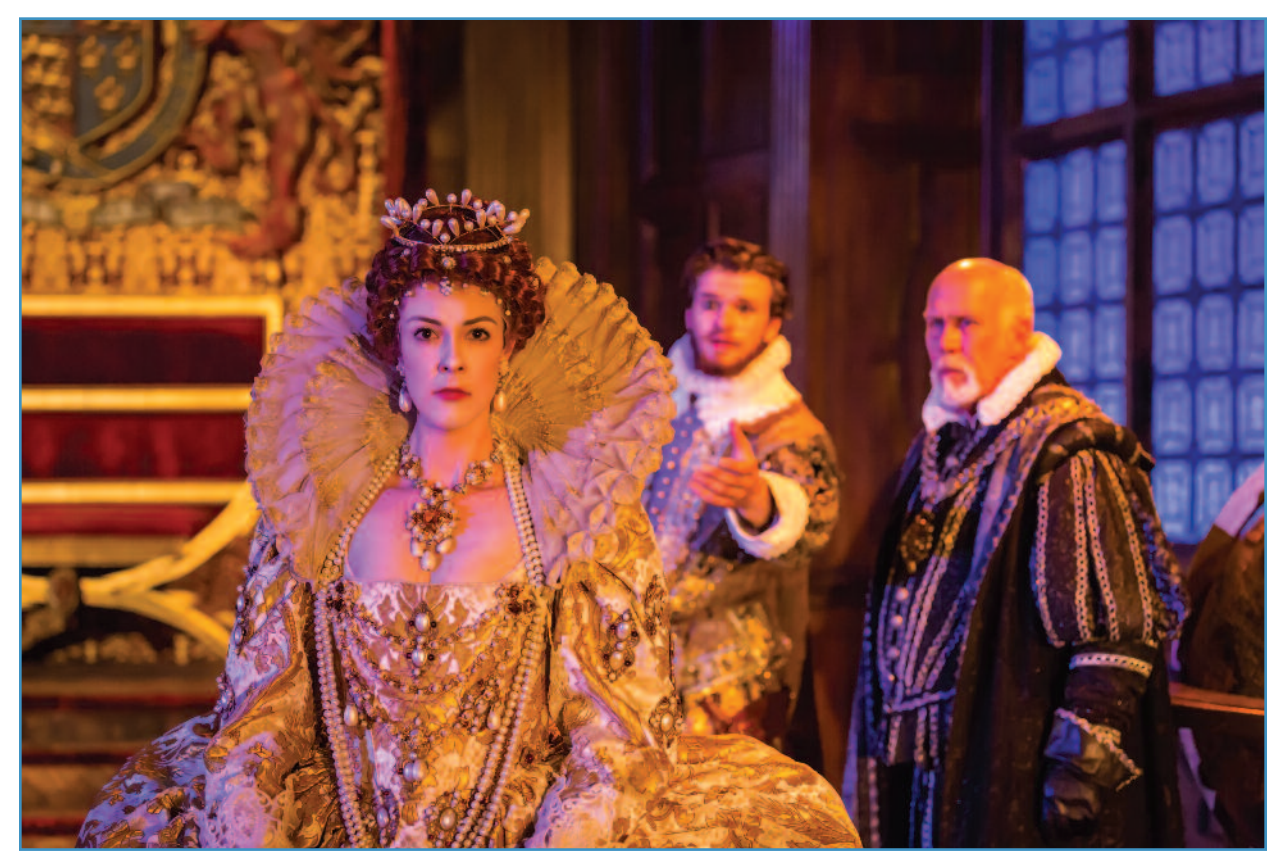
The Queen's chamber scene, the author notes, "begged for low-profile LED strip lighting." He chose lumenfacade units from Lumenpulse.